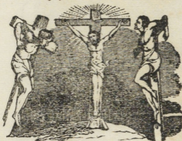
The Crucifixion of Christ,