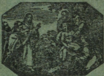
Lazarus raised to life.