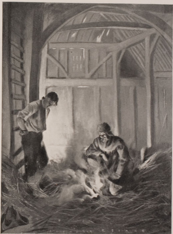
DESPITE HIS EFFORTS THE STRAPS HELD FIRMLY.