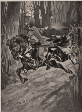
HE FIRED DIRECTLY AT THE MEN